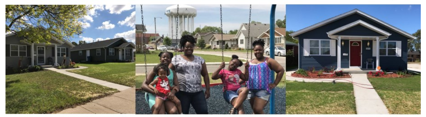
1801 & 1811 Adams Street

Where: Field of Dreams 1829 & 1843 Adams Street